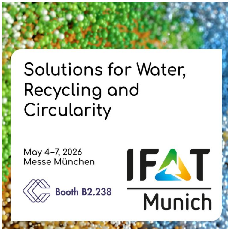
Image 1: Visitors to IFAT Munich 2026 will be able to meet Cerafiltec technical experts and learn how its flat-sheet ceramic membrane solutions deliver exceptional performance and dramatically improved lifespan.