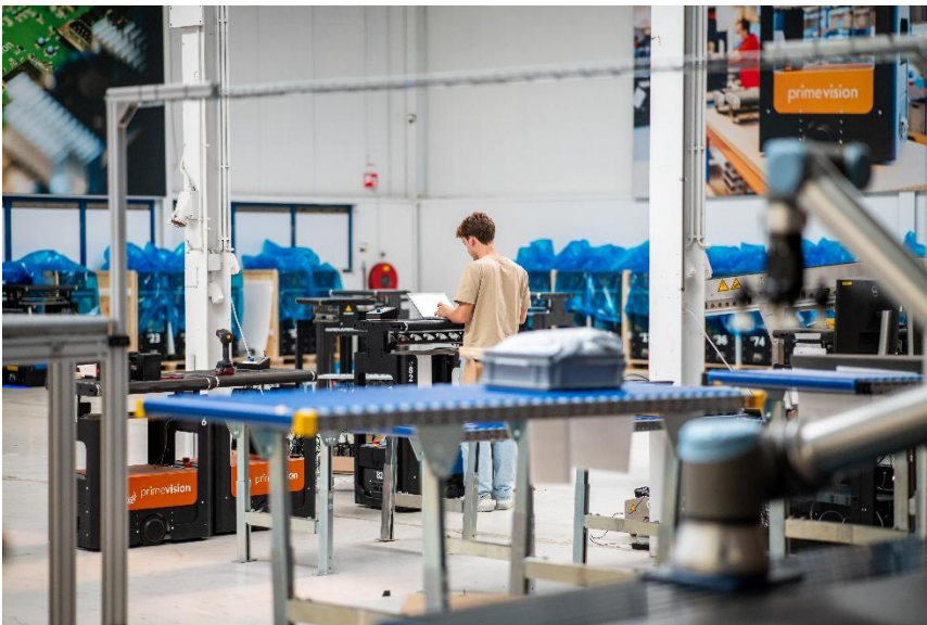
Image 2: Prime Vision's intelligent, vendor-agnostic platform integrates with existing systems, helping organisations optimise every step of their sorting process.

Image 1: Prime Vision and Dell Technologies have won the Computable Award 2025 for their Vision AI and robotics solution for efficient parcel sorting.