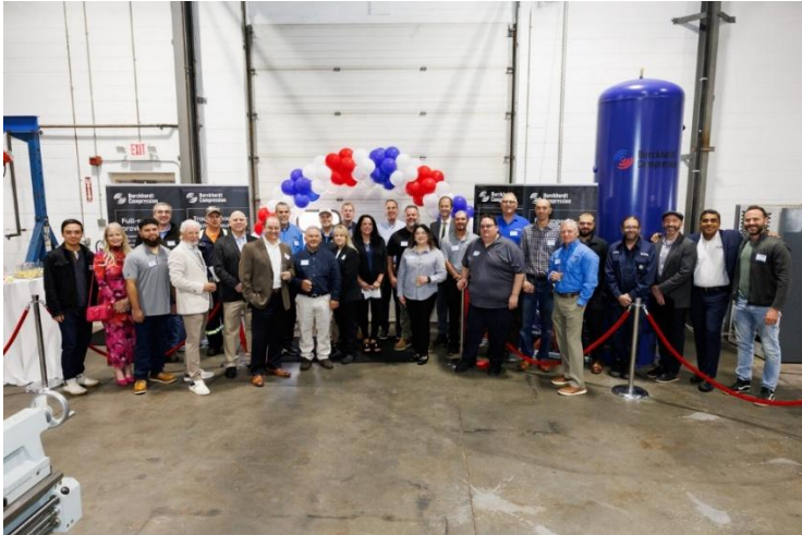
Image 1: The new facility was launched with a red-carpet ribbon-cutting ceremony featuring expert speakers and guided tours of the new facility.