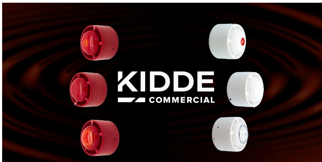
Image 2: Each device features a sleek, low-profile design, intuitive installation, and technology that enables faster, clearer communication during emergencies.

The image(s) distributed with this press release are for Editorial use only and are subject to copyright. The image(s) may only be used to accompany the press release mentioned here, no other use is permitted.