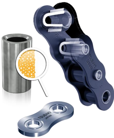
Image 4: Tsubaki's Lambda chain with NSF-H1 food-grade lubrication.

The image(s) distributed with this press release are for Editorial use only and are subject to copyright. The image(s) may only be used to accompany the press release mentioned here, no other use is permitted.