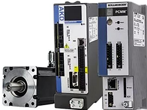
Image 3: Servo Systems, Kollmorgen 2G Motion System significantly enhances torque and responsiveness, improve operator safety, easy installation.

The image(s) distributed with this press release are for Editorial use only and are subject to copyright. The image(s) may only be used to accompany the press release mentioned here, no other use is permitted.