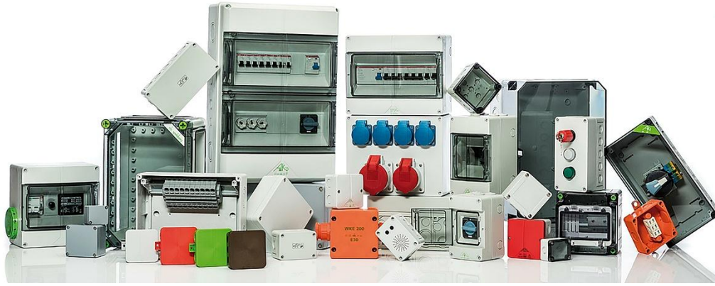
Image 3: Spelsberg product range comprises more than 5,000 wide available products.

The image(s) distributed with this press release may only be used to accompany this copy and are subject to copyright. Please contact DMA Europa if you wish to license the image for further use.