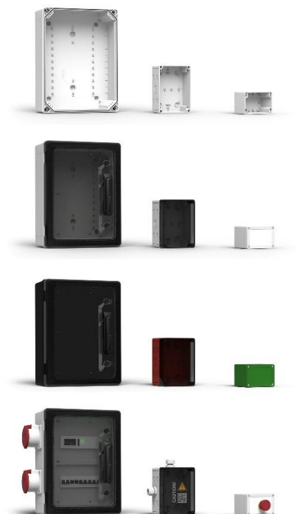
Image 2: Spelsberg offers consulting services from development and production to testing and certification.

Image 1: A chain is defined by several individual components that are all flexibly interwoven in order to accommodate heavy loads and transport from A to B.