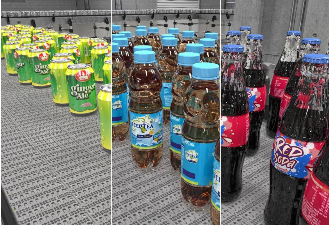
Image 1: Whether handling bottles, cans, or specialty containers, Regal Rexnord supports line optimization at every stage.