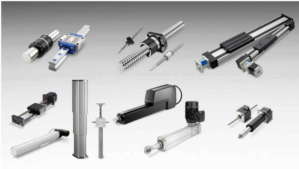
Image 5: The Thomson booth will also feature a range of linear bearings, guides, ball screws, and round rail assemblies suited for factory automation, packaging, and robotics applications.