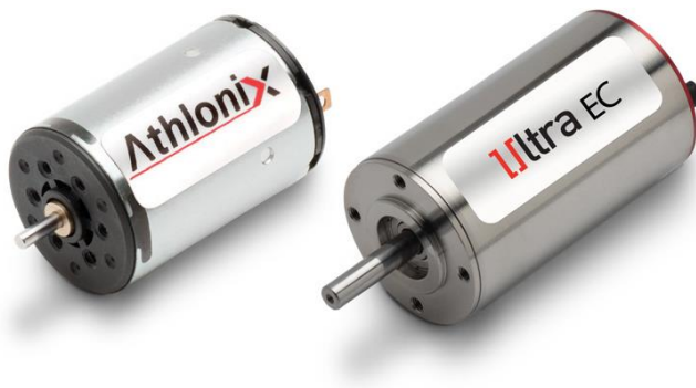
Image 6: Portescap will present its precision miniature motor technologies, including brushless DC, brush DC, and stepper motor solutions, that are ideally suited for advanced industrial automation.