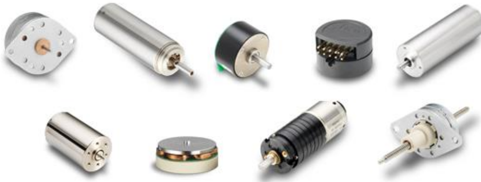
Image 7: Portescap will present its precision miniature motor technologies, including brushless DC, brush DC, and stepper motor solutions, that are ideally suited for advanced industrial automation.

The image(s) distributed with this press release are for Editorial use only and are subject to copyright. The image(s) may only be used to accompany the press release mentioned here, no other use is permitted.