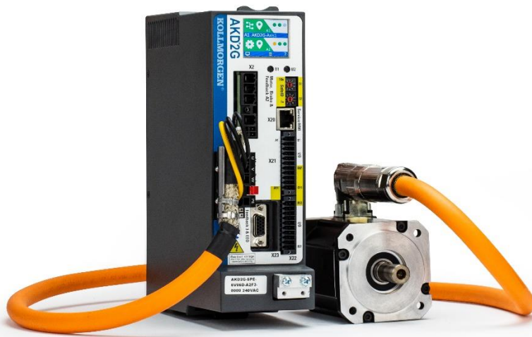
Image 2: Kollmorgen will present its latest generation of servo motors and drives, featuring real-time responsiveness, multi-axis coordination and high-performance, precision control.