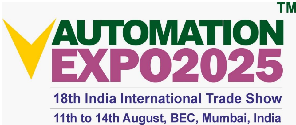
Image 1: Automation Expo India 2025 will take place from 11-14 August at the Bombay Exhibition Centre, Mumbai.