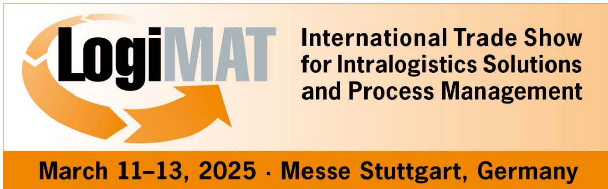
Image 1: Regal Rexnord will be attending LogiMAT 2025, the leading international trade show for intralogistics solutions and process management.