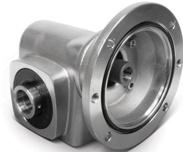
Image 3: Boston Gear Gen 2 SS700 series stainless-steel worm gearboxes are now available in new sizes and larger output shaft bores.

The image(s) distributed with this press release are for Editorial use only and are subject to copyright. The image(s) may only be used to accompany the press release mentioned here, no other use is permitted.