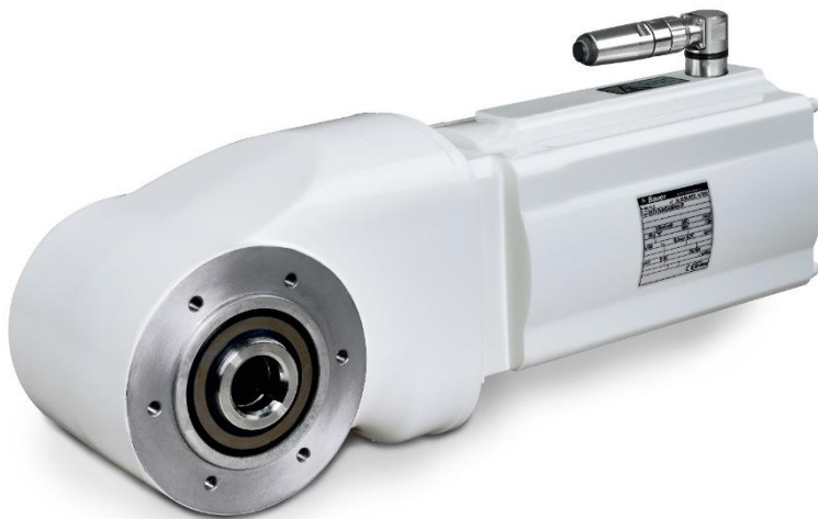
Image 2: An aseptic-coated HiflexDRIVE is highly suitable for washdown environments.