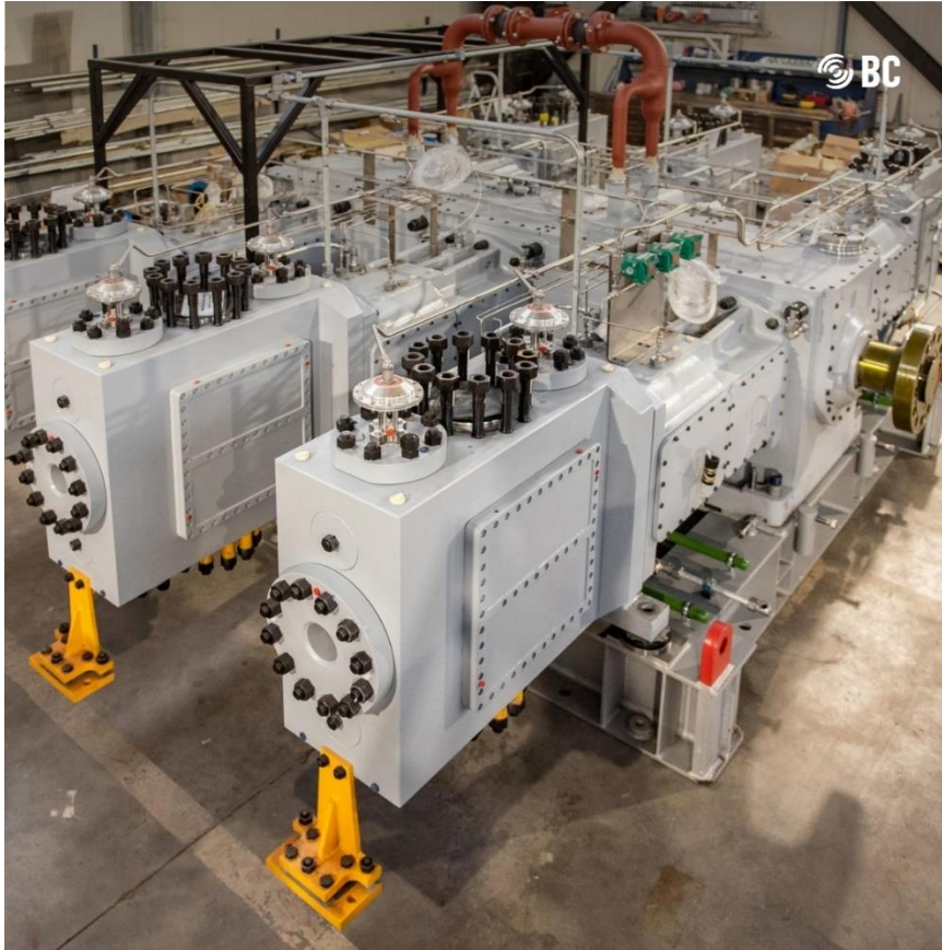
Image 1: HS-C/HS-E New Build Compressor Packages offer tailored configurations to meet any operator's specific requirements.