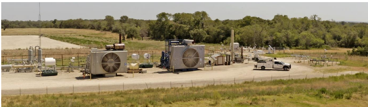
Image 2: HS-C Direct Drop-In Replacements are designed to seamlessly replace a wide range of compressors with minimal modifications.