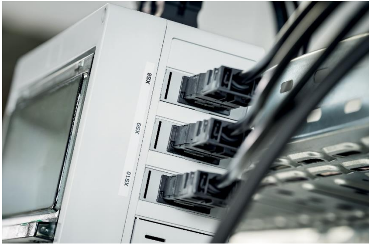
Image 1: Spelsberg TKS enclosures with pre-assembled components and pluggable systems tailored to each customer.