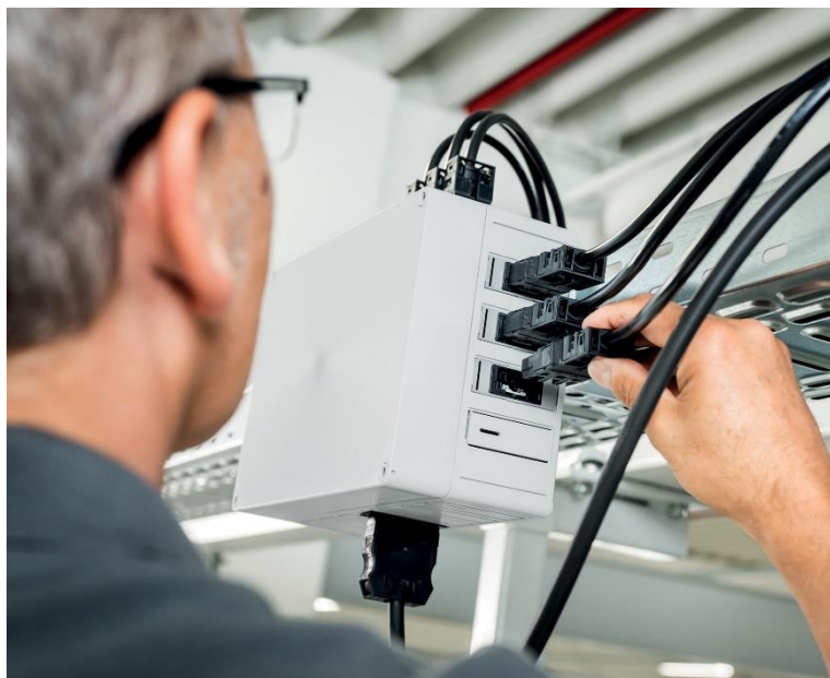
Image 3: TKS range helps contractors to improve the cost-effectiveness of installing electrical infrastructure in any project.