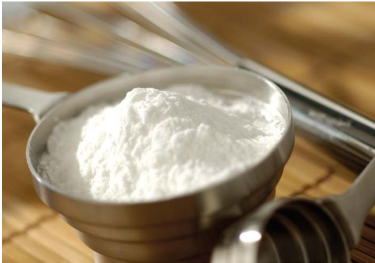
Image 1: Producing potato starch involves technical challenges at each step of the process