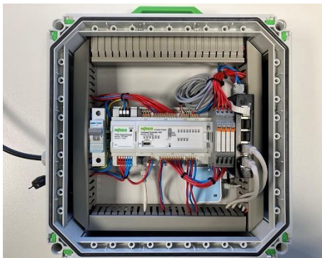
Image 2: WAGO has chosen the Spelsberg GTi series of polycarbonate distribution boxes as a convenient and aesthetic housing solution to house transportable demo systems.

Image 1: WAGO has chosen the Spelsberg GTi series of polycarbonate distribution boxes as a convenient and aesthetic housing solution to house transportable demo systems.