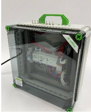
Image 1: WAGO has chosen the Spelsberg GTi series of polycarbonate distribution boxes as a convenient and aesthetic housing solution to house transportable demo systems.