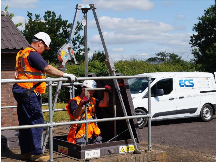
Image 1: ECS Engineering Services celebrates 'Hat-Trick' in recertification