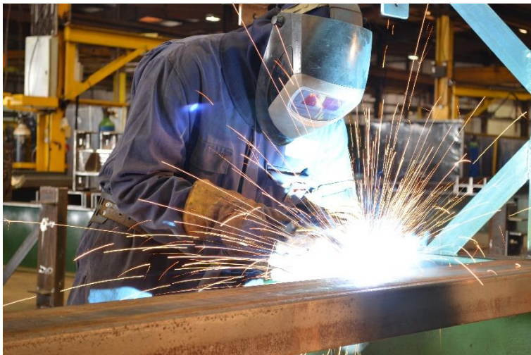
Image 2: ECS achieves BS EN ISO 3834 – Fusion Welding of Metallic Materials