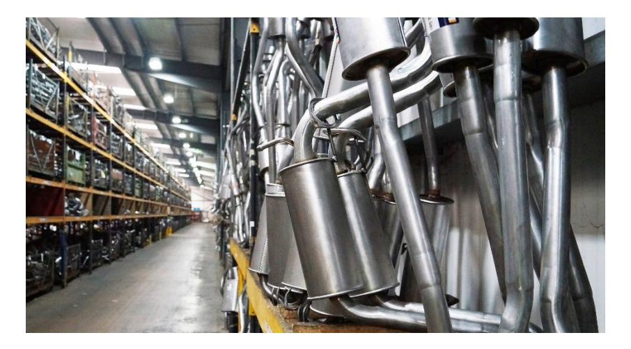
Image 2: Klarius has a wide and diverse product range covering popular and niche classic models to meet demand.