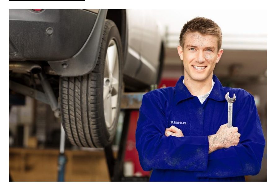
Image 1: Klarius provides excellent aftermarket support for classic cars, making the job for the garages much easier with high quality replacements.