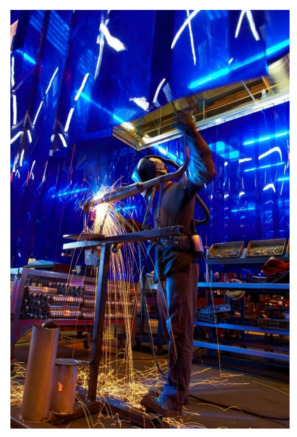
Image 4: Robust design and manufacturing processes ensure only the highest quality replacement exhaust systems.