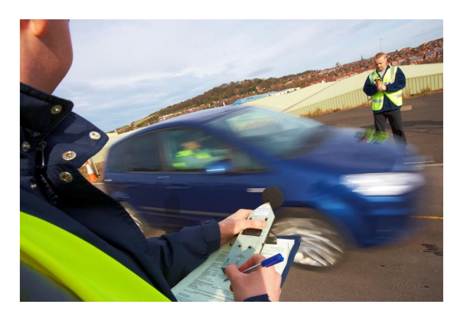
Image 5: Thorough testing on cars of correct make, model and year ensures optimal fitment and performance, backed by type approval where applicable.

The image(s) distributed with this press release are for Editorial use only and are subject to copyright. The image(s) may only be used to accompany the press release mentioned here, no other use is permitted.