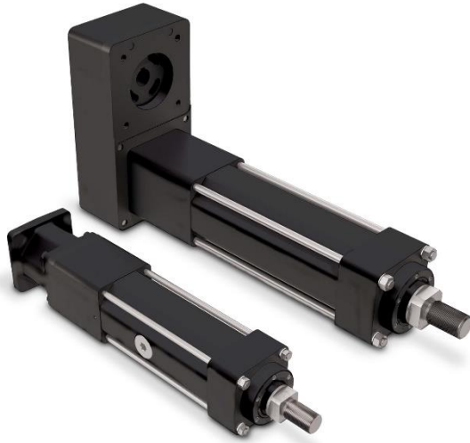
Image 1: Tolomatic expanded RSX range includes five new sizes, capable of producing forces up to 294 kN (66,000 lbf).