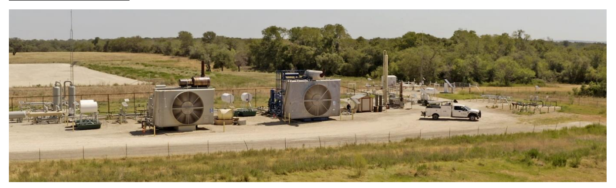
Image 1: In the video, we meet Burckhardt Compression field service technicians in North America as they visit sites throughout the state, conducting around-the-clock compressor maintenance for customers.

The image(s) distributed with this press release are for Editorial use only and are subject to copyright. The image(s) may only be used to accompany the press release mentioned here, no other use is permitted.