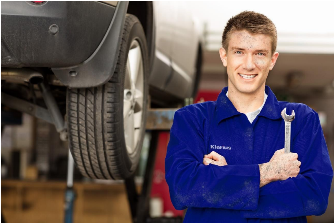
Image 1: The expertise and skill of service garages are indispensable.