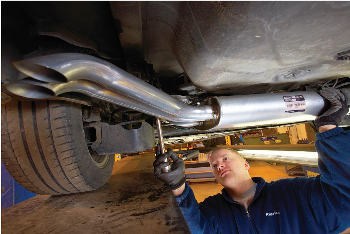
Image 3: Garages can help customers save money by recommending a quality aftermarket exhaust replacement.

The image(s) distributed with this press release are for Editorial use only and are subject to copyright. The image(s) may only be used to accompany the press release mentioned here, no other use is permitted.