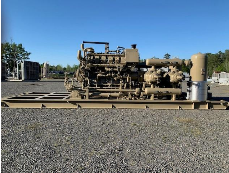
Image 5: Side view of the Ariel compressor, showcasing its intricate components

The image(s) distributed with this press release are for Editorial use only and are subject to copyright. The image(s) may only be used to accompany the press release mentioned here, no other use is permitted.