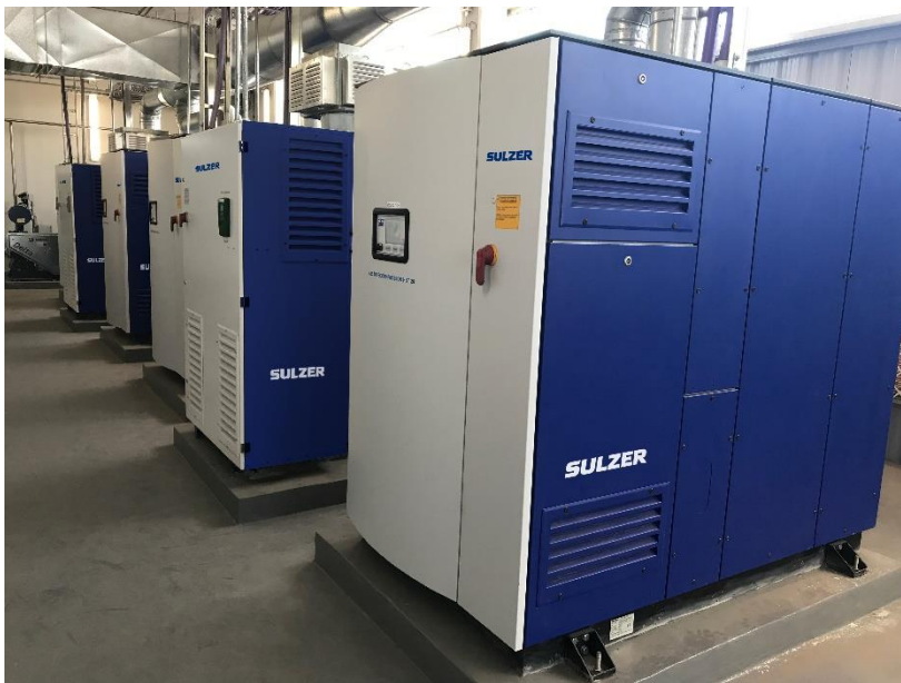
Image 2: Sulzer's HST turbo compressors at Refineria del Centro site