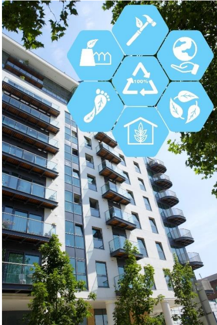
Image 1: Recycled PVCu beads render steel alternatives unsustainable