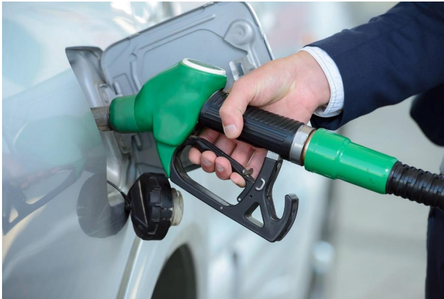
Image 1: Fuel efficiency can be affected by the exhaust system fitted to a vehicle