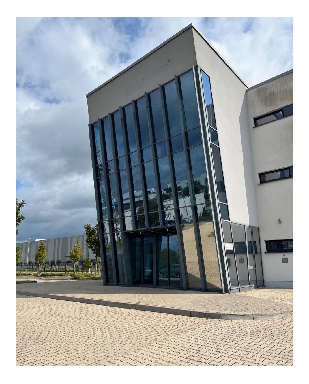
Image 1: The new hub will provide Sulzer Chemtech's customers with additional localized manufacturing and engineering support.