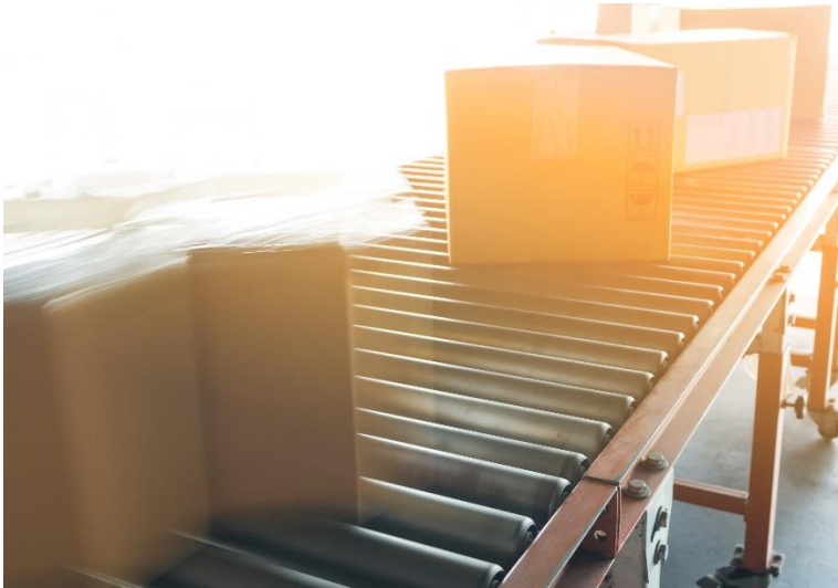
Image 1: Specialised analytics software can help with harnessing big data to identify and implement efficiency improvements at a warehouse or fulfilment centre.