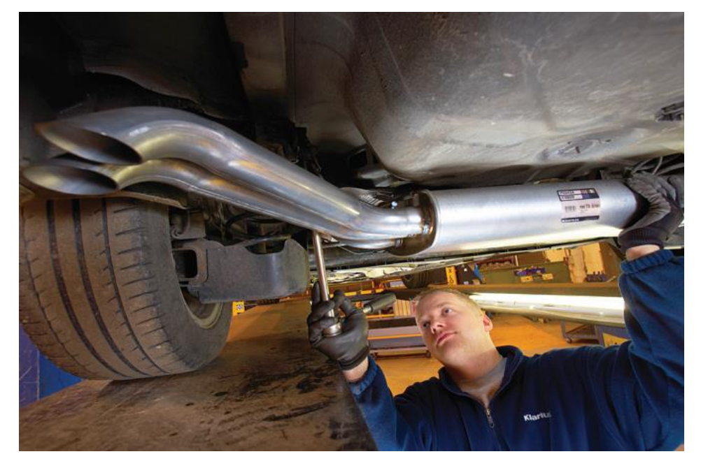
Image 1: Klarius has a strong commitment to supporting garages with technical advice