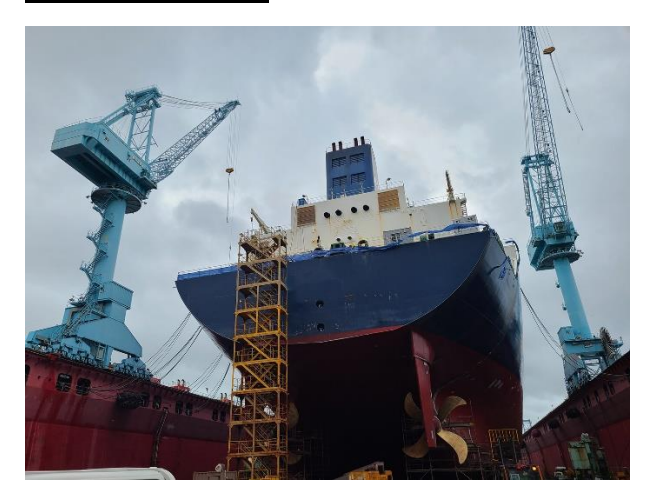
Image 1: Customer vessel in dry dock awaiting service of its compressor