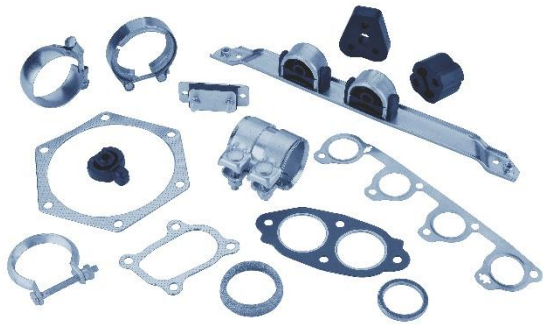
Image 1: Klarius offers a wide range of bespoke mountings for when a replacement is needed.