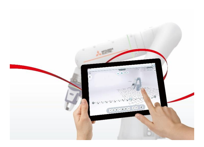
Image 1: The latest update to Mitsubishi Electric's RT Toolbox3 and iQ Works2 offers a new visual editor for programming SCADA and six-axis industrial robots.