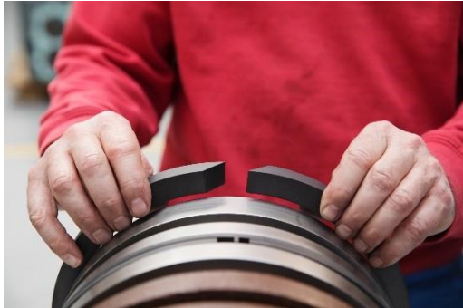
Image 3: Be it rod, piston or oil sealing, rings are of utmost importance for the efficiency of the compressor system.