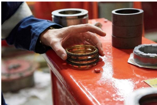
Image 4: Exact design and manufacturing to meet compressor requirements ensure low to zero leakage.

The image(s) distributed with this press release are for Editorial use only and are subject to copyright. The image(s) may only be used to accompany the press release mentioned here, no other use is permitted.