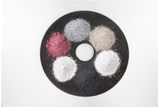
Image 1: Burckhardt Compression develops its own Persisto® material specifically suited for reciprocating compressors