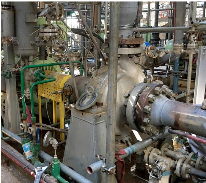
Image 2: ZF pump with the coke crusher for the large solids abrasive service