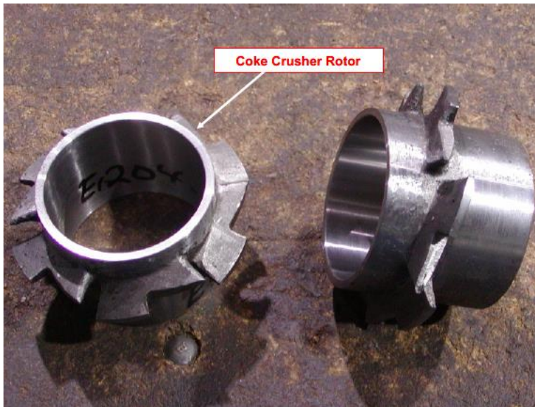
Image 3: The coke crusher rotor for the large solids abrasive service

The image(s) distributed with this press release are for Editorial use only and are subject to copyright. The image(s) may only be used to accompany the press release mentioned here, no other use is permitted.