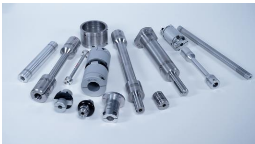
Image 3: Huco has built a reputation for providing a comprehensive range of standard and customised precision couplings to food and beverage processing machinery OEMs.

Image 2: Bauer Gear Motor will be showcasing its highly efficient, hygienically designed range of geared motors for use in demanding washdown environments.