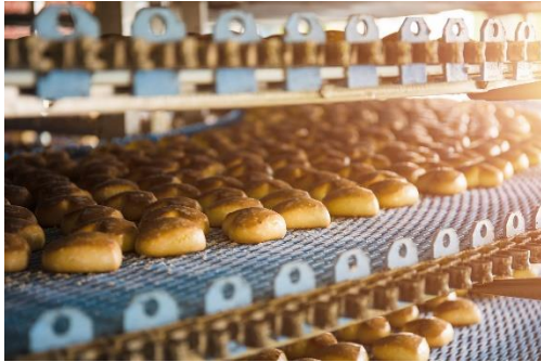
Image 1: Leading brands of Altra Industrial Motion Corp., Bauer Gear Motor and Huco, will be displaying hygienic motors and precision couplings for the food and beverage industry at Anuga FoodTec 2022.