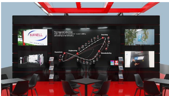
Image 3: The services available through EPLAN are designed to make efficient engineering as easy as possible for its customers.