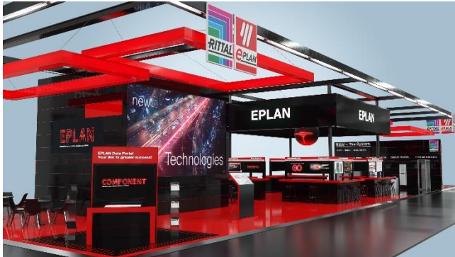
Image 1: EPLAN has unveiled a new virtual exhibition stand, which is hosted at IndustryExpo – the world's first truly virtual exhibition.