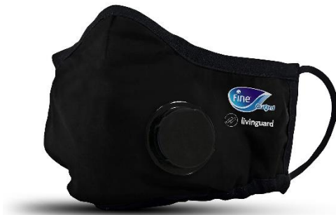
Image 2: There are two designs, the Comfort Mask and the N95 Anti-Viral Mask, both offer vastly improved protection when compared to a paper mask or loose weave fabrics.