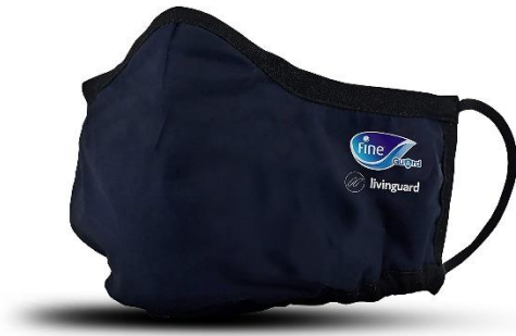
Image 3: There are two designs, the Comfort Mask and the N95 Anti-Viral Mask, both offer vastly improved protection when compared to a paper mask or loose weave fabrics.