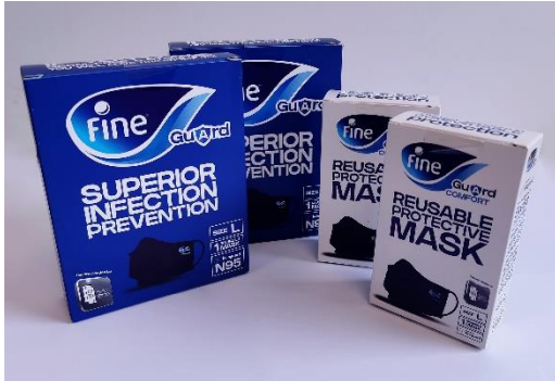
Image 1: The latest face masks launched by UK company Emissco use a patented swiss boundary layer that can deactivate the coronavirus.