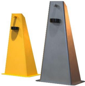
Image 1: Emissco's zero contact, high capacity hand sanitiser dispenser range.