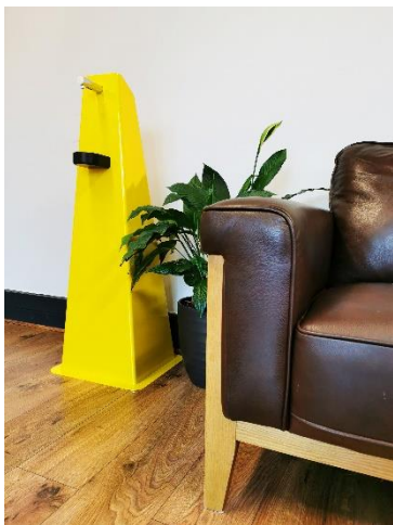
Image 2: Designed to help limit the spread of COVID-19 in the workplace, improving safety for factories & warehouses, healthcare facilities, schools, entertainment and other commercial premises.