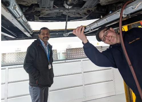
Image 1: Klarius is working directly with essential workers in the healthcare sector to ensure they receive the parts they need as fast as possible.