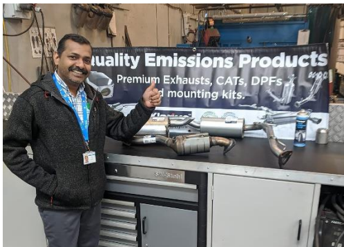
Image 2: Klarius is working directly with essential workers in the healthcare sector to ensure they receive the parts they need as fast as possible.