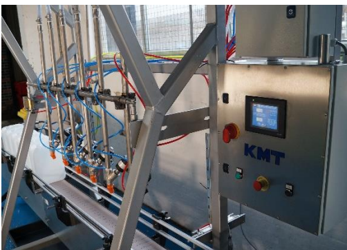
Image 5: A premium partner of Yara in the UK and Ireland, the world's largest manufacturer of AdBlue®, Emissco will continue to deliver AdBlue®, primarily in 10L containers (representing over 90% of sales) to retailers, garage forecourts, motor factors and repair shops.