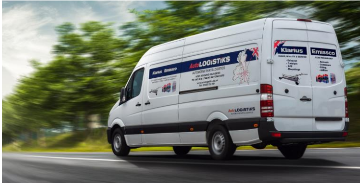
Image1: Klarius expands European delivery network for high quality aftermarket exhausts