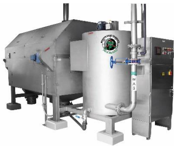
Image 4: Visitors will also have the opportunity to see the Monster Fine Screen and Monster Drum Thickener on stand.

The image(s) distributed with this press release are for Editorial use only and are subject to copyright. The image(s) may only be used to accompany the press release mentioned here, no other use is permitted.