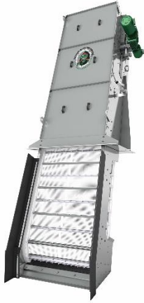
Image 3: Visitors will also have the opportunity to see the Monster Fine Screen and Monster Drum Thickener on stand.