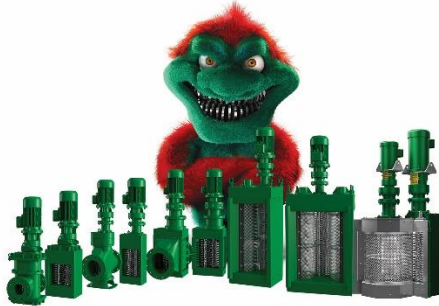
Image 1: With almost 50 years' experience in tackling the challenges of the wastewater industry, the Muffin Monster range of grinders has become the first choice to protect pumping stations and sludge system equipment.