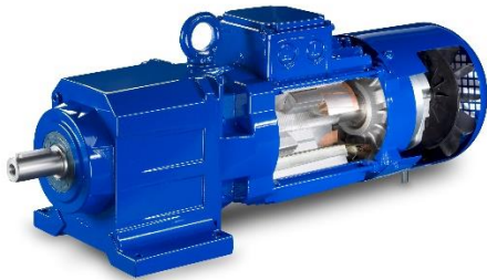
Image 1: Bauer is a market-leader in geared motor technology, offering high efficiency and hygienic designs.