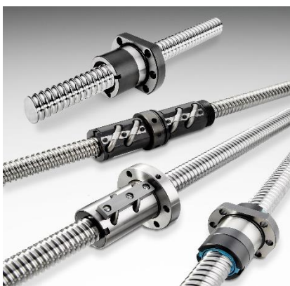
Image 3: High-load ball screws from Thomson provide a long service life.