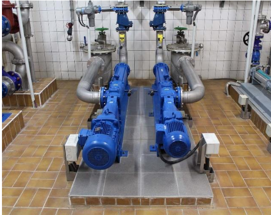
Image 1: Bauer Gear Motor has collaborated with Allweiler, combining highly efficient permanent magnet synchronous motors (PMSMs) with Allweiler progressive cavity pumps, at Stendal wastewater treatment plant in Germany.