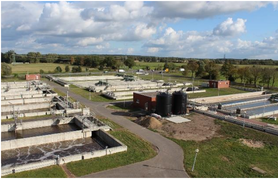
Image 3: The wastewater treatment plant at Stendal is aiming to be entirely energy self-sufficient by 2025, so it is installing new, efficient equipment.

The image(s) distributed with this press release are for Editorial use only and are subject to copyright. The image(s) may only be used to accompany the press release mentioned here, no other use is permitted.