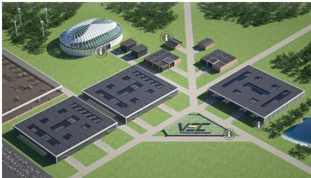
Image 1: VirtualMachineXpo.online is currently in-build in Hall #3