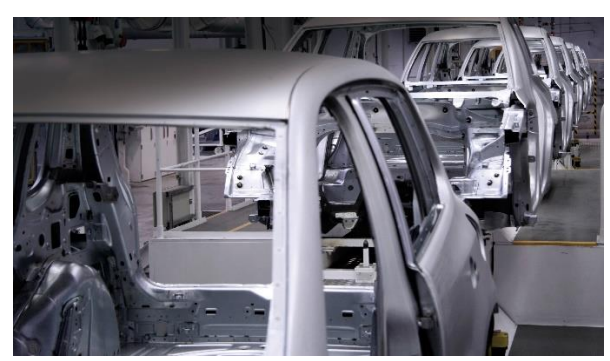
Image 1: Tsubaki recommended its maintenance-free, Lambda series of self-lubricated chain.

Image 2: Car parts are moving constantly through the assembly process on overhead conveyors, taking them from one workstation to the next.