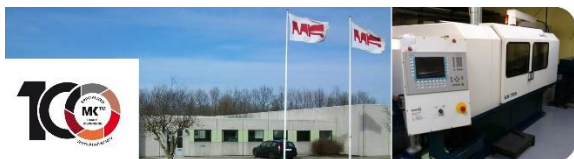
Image 1: MK headquarters and production under the Krøger A/S brand