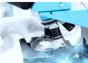
Image 3: PAT-driven automated applications can stop mixing processes at the right time as well as adjust processing conditions on-the-fly.

Image 2: Smart, automated process control strategies based on Process Analytical Technology (PAT) offer a key opportunity to overcome material segregation and achieve optimum blends.