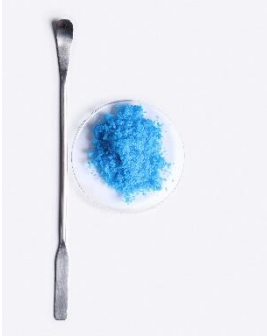
Image 1: Solid mixing is one of the most common and challenging processes for many manufacturing industries.