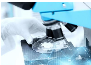
Image 3: PAT-driven automated applications can stop mixing processes at the right time as well as adjust processing conditions on-the-fly.

Image 2: Smart, automated process control strategies based on Process Analytical Technology (PAT) offer a key opportunity to overcome material segregation and achieve optimum blends.