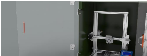
Image 2: WDS hinges manufactured from high quality 316 stainless steel for use on doors in hygienic applications, as well as marine environments, providing strong resistance to salt water corrosion.

The image(s) distributed with this press release are for Editorial use only and are subject to copyright. The image(s) may only be used to accompany the press release mentioned here, no other use is permitted.