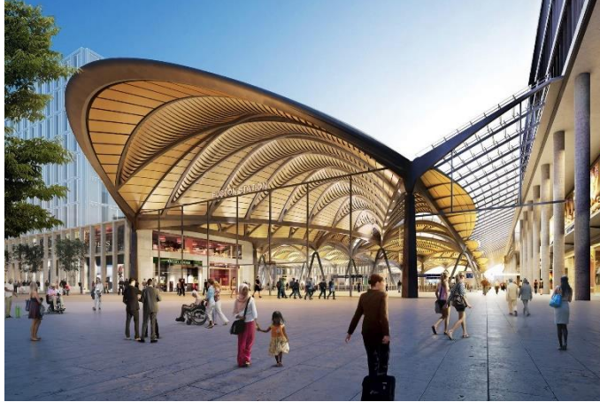
Image 1: Mitsubishi Electric's automation equipment is helping London Euston train station futureproof its traction power infrastructure as part of the High Speed Two (HS2) railway line project