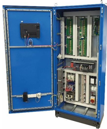
Image 3: To ensure reliable and fast inter-substation data transfer, a proven high-bandwidth open network technology, such as CC-Link IE, was needed

The image(s) distributed with this press release are for Editorial use only and are subject to copyright. The image(s) may only be used to accompany the press release mentioned here, no other use is permitted.