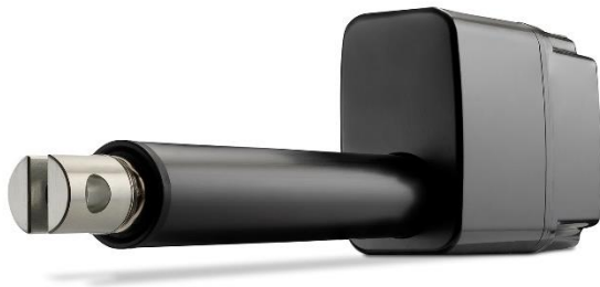
Image 5: Thomson actuators are more cost-effective and offer high levels of control for automation applications.