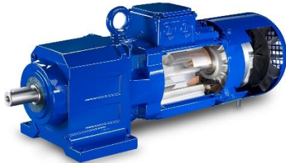
Image 1: Bauer will be holding a live demonstration of its highly efficient permanent magnet synchronous motor (PMSM) drive technology on stand.